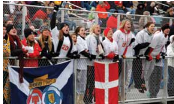
Cheering for the Vikings at Nationals.